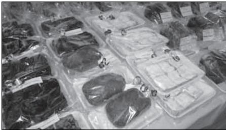
There was a large selection of baked goods at the Stockton Jewish Food Fest.

W e will be holding our first Jewish Food Fest, with great Jewish food, activities and entertainment, on August 19, 2012. Many other synagogues around the county hold food fairs like this, which are profitable fundraisers plus effective community builders. The event will be open to the community and be widely advertised in the Bay Area.