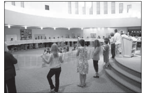
Scenes from last year's Simchat Torah Service.

J ust when you thought the Jewish holidays were ending, along come two of the most significant of the annual cycle of Jewish ritual observances: Sukkot and Simchat Torah .