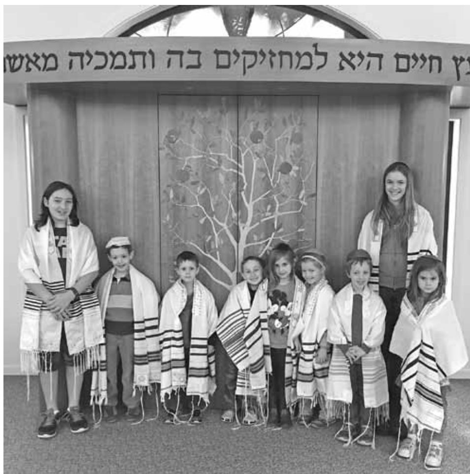
StARS 2015/2016 Kindergarten Class: Learning how we pray. Future rabbis?